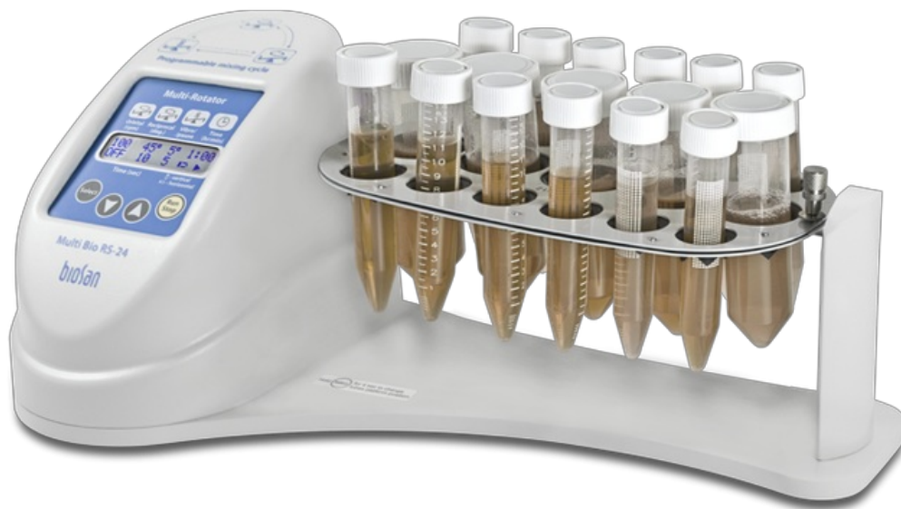
Multi Bio RS-24 Including PRS-26 platform Programmable rotator